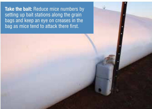
Take the bait: Reduce mice numbers by setting up bait stations along the grain bags and keep an eye on creases in the bag as mice tend to attack there first.

Checking as often as twice daily may be required if vermin are plentiful during wet weather. During normal conditions check at least weekly. Patch any tears or punctures with quality tape or silicone to prevent moisture entering the grain bulk.