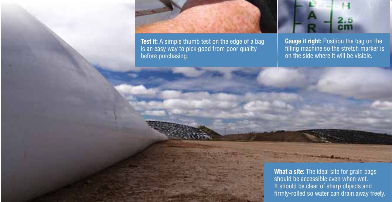
What a site: The ideal site for grain bags should be accessible even when wet. It should be clear of sharp objects and firmly-rolled so water can drain away freely.